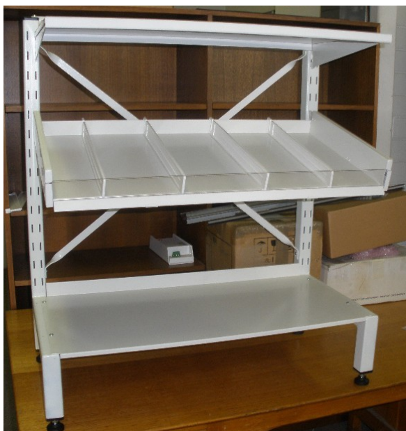
Photos showing a sloping open view tray in its normal position and in an extended position for easy loading.

Skirting drawers on wheels are available to fill the valuable space underneath the PharmaFlow frame.